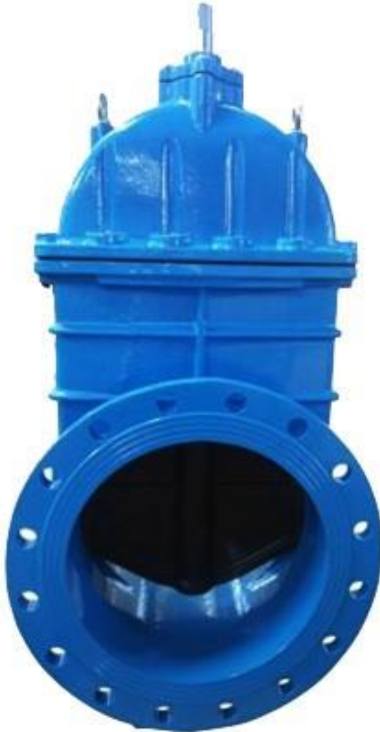
Resilient Seated Gate Valve